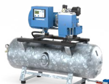
C 7 LR

Pressure range: 5 – 15 bar Drive power: 2.2 – 315 kW Free air delivery: 0.2 – 43 m³/min