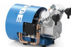
PO 2 L

Pressure range: 8 – 40 bar Drive power: 0.75 – 11 kW Free air delivery: 70 – 2,300 l/min