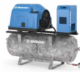
PO 8 LDR