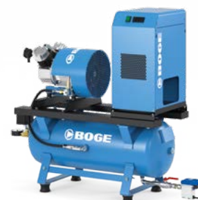
P 2 LDR

Pressure range: 8 – 40 bar Drive power: 0,75 – 11 kW Free air delivery: 75 – 7,320 l/min