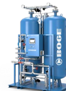
Twin Tower O 1500 P