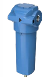
Pre-filter F 18-2 P