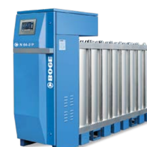
Nitrogen generator N 64-2 P