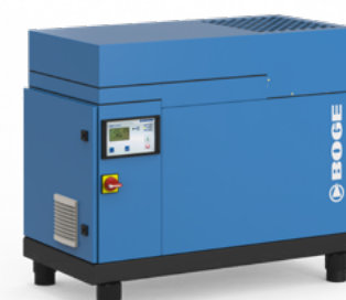
C 14 PM