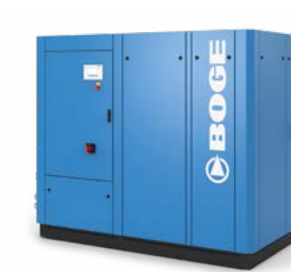
S 76-4 LF