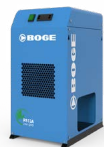
Refrigerant compressed air dryer DS 9-2