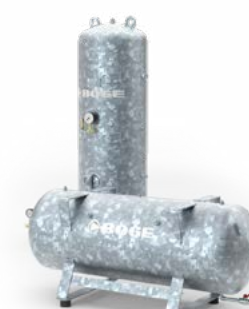
Compressed air receiver 500l