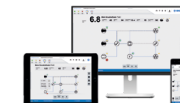
airtelligence provis 3