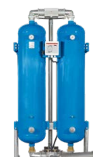
Adsorption dryer DAZ 126-2