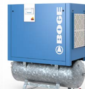
C 22-2 DR