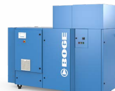
SLF 40-3 bluekat