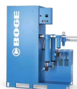
Converter BC 75 bluekat