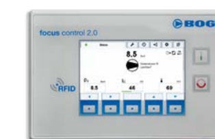
focus control 2.0