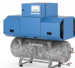
K 15- /K 15-booster